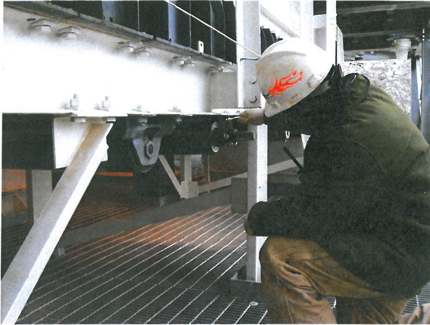
Inspecting the return side of the conveyor system.

be used as an emergency fix and not as a long-term solution. Belt fabrics that are exposed to the weather or to product contamination should be properly cleaned, dried and then covered with new rubber. These repairs are critical to prevent moisture from penetrating the belt and breaking down the cover adhesions and to prevent product contamination from abrading the carcass and breaking down the adhesions. The splice can also be inspected and, if damage is visible, it is suggested that it be repaired or replaced. This is also a good time to walk the conveyor and check the following components: