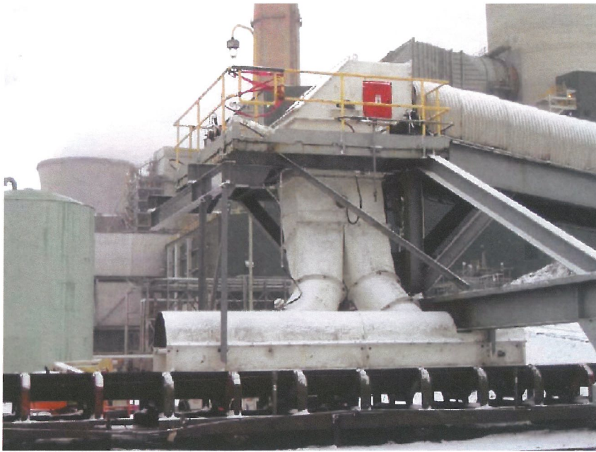
3-DEM™ designed transfer chute on a bi-directional coal yard belt at a major power plant.