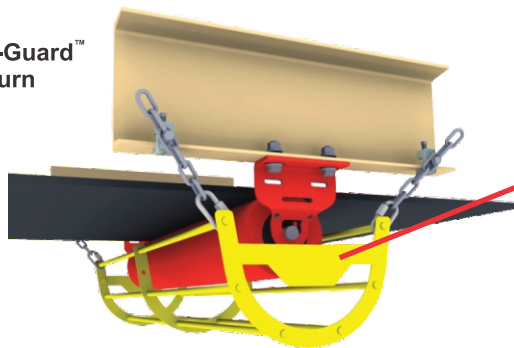
ASGCO® Safe-Guard™ Conveyor Return Idler Cage

After a thorough inspection of the conveyor it was pointed out that in addition to resolving the belt mis-tracking issue there needed to be further changes made to ensure safety in the workplace and to comply with OSHA and MSHA requirements. It was recommended that they install ASGCO® Safe-Guard™ Return Idler Cages to protect the return rollers and objects from falling, preventing injuries to workers and equipment.